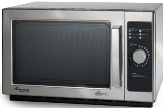
Model RCS10DS shown